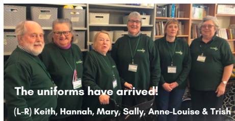
The uniforms have arrived!