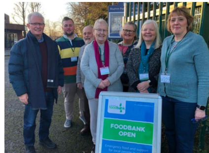
Official opening & the Foodbank sign is out!

In January, we opened a new Distribution Centre in Houghton Regis. In just 2 months, the new centre has provided meals for 320 adults and children which demonstrates the increasing need for support in our community. The centre, based at Houghton Regis Baptist Church on Hammersmith Gardens, runs with a brilliant group of new volunteers who have certainly hit the ground running with meeting clients, packing up food parcels and getting to know all the background information needed to run a Foodbank centre.