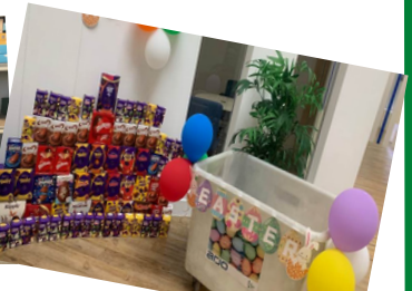
Easter eggs donated by the staff at Arjo

So many people in the community have been generous over Easter, donating Easter Eggs and chocolate goodies for us to provide for clients. Individual donations as well as gifts from local and national companies have enabled us to include Easter treats with food parcels. Thank you so much to everyone who have collected, donated - we're eggstremely grateful!