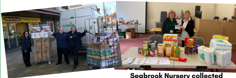
A donation from the new Heron Foods store in Houghton Regis