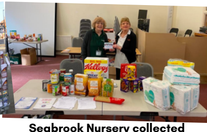
Seabrook Nursery collected chocolate eggs & food