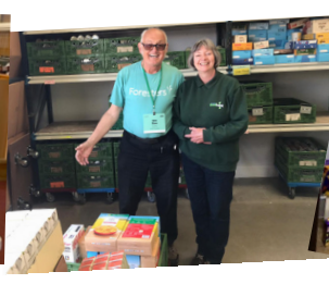
Will from Foresters Financial, donating almost a tonne of food!