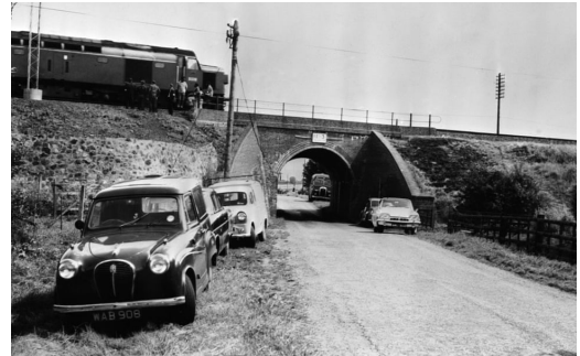
Bridego Bridge. The scene of the crime.

Pass beneath the West Coast Main Line, turn left into an unassuming industrial site called the Oakland Enterprise Park, and a visitor to Dunstable Foodbank will pull up outside a warehouse unit, nestled between an eyeglass wholesaler and a sports car garage, which is just as anonymous as that nearby bridge. There is nothing visible to suggest what goes on here. Yet, behind a shuttered entrance large enough to accommodate the loading and unloading of the Foodbank's Transit van, another 'gang' might be discovered undertaking the kind of work that would have put the crooked ambitions of the Great Train robbers to shame.